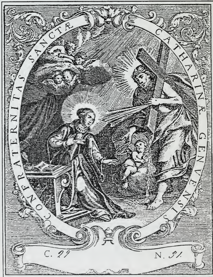
Pagella di aggregazione alla confraternita de Santa Caterina da Genova tratta dalla matrice from Genova: Il Sestiere di Portoria, p. 36.

Department of Modern Languages Kansas State University Manhattan, KS 66506 RCLARK@KSU.EDU